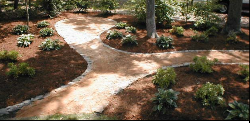
A walkway by Leisure Landscapes at the beautiful Foland residence.

The walkway itself can widen the range of the sensory enjoyment of your landscape. Walking on varied textures and having a choice of following the path or not will make strolling to the mailbox a pastime instead of necessity.