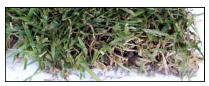
St. Augustine is more shade tolerant and does well on the coast.