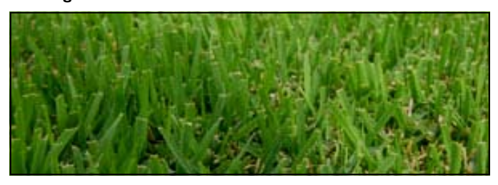
Zoysia is considered the best for choking out weeds and low maintenance.