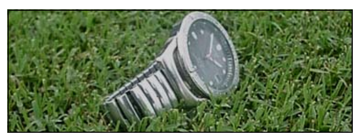
Shown here is a new Bermuda hybrid, YUKON, that uses 25% less water than other Bermuda varieties.

But having said all that, the savings are significant, A typical warm season lawn will save $1,200 a year in mowing and fertilizing costs, yielding a break-even of installation costs in only 3 years.