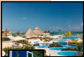
Riviera Maya, Cancun, and Chichen Itza