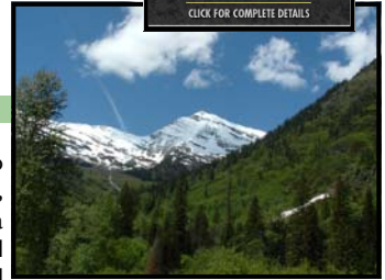
Snowshoe, West Virginia for a brisk vacation