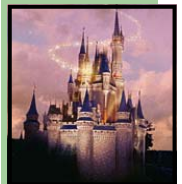
A World of entertainment in Orlando