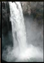
Ku'uai, the Garden Isle...